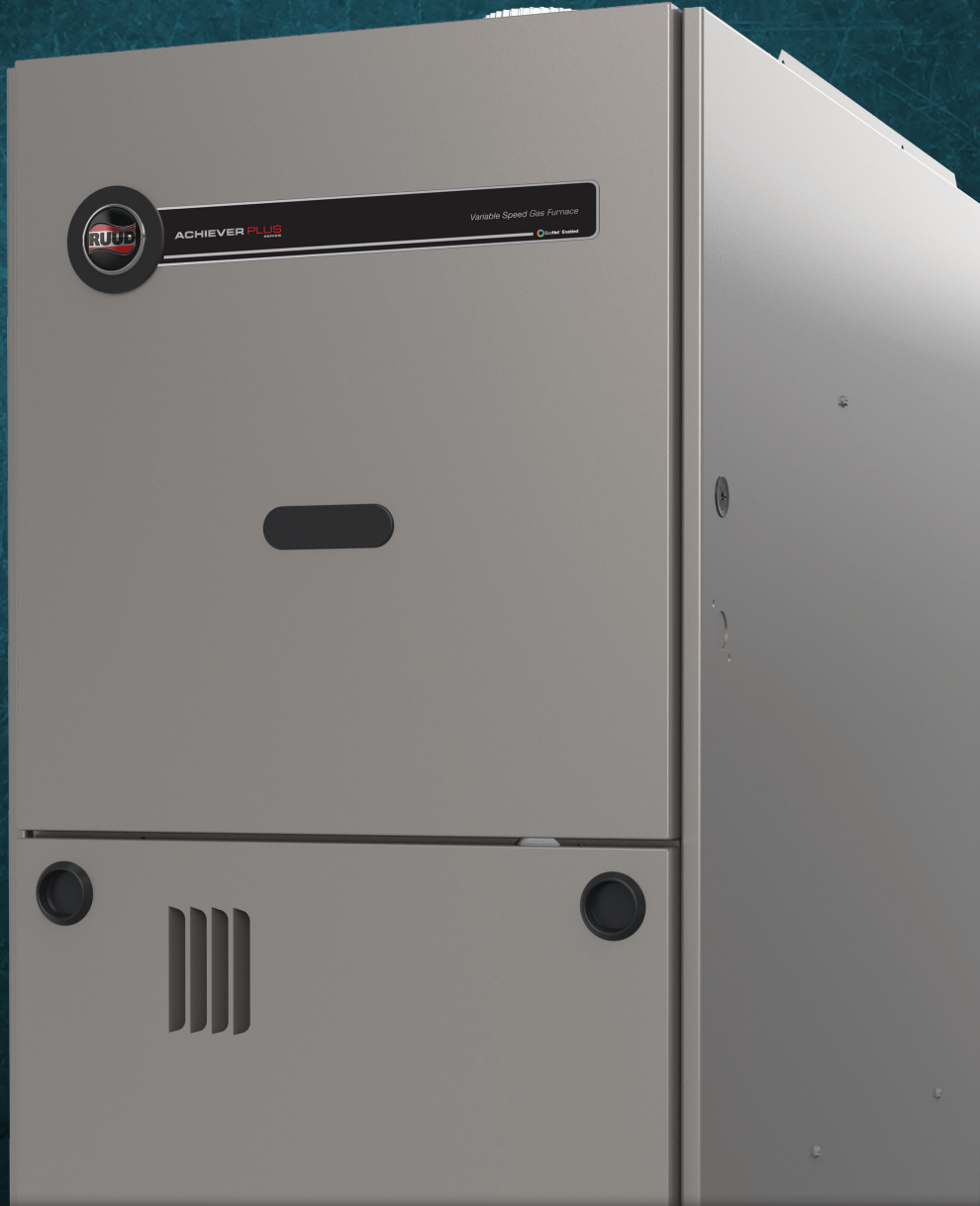
Downflow model shown