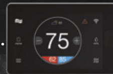
EcoNet Smart Thermostat