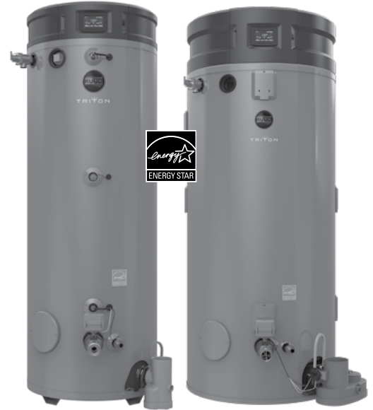
Triton SS 80 & 100-Gallon