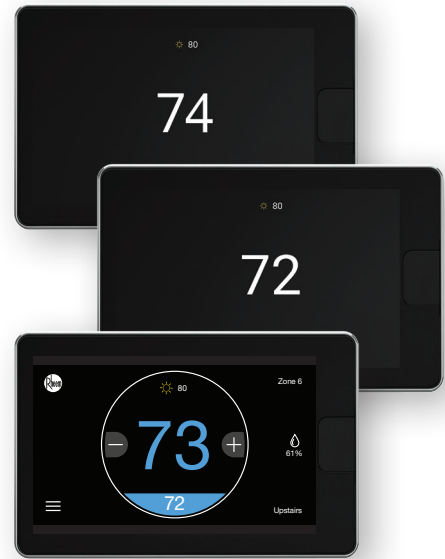
EcoNet Zone Control RECTL700ZON